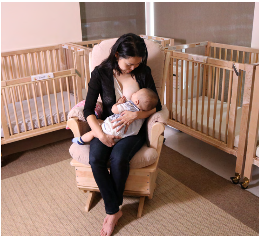
Figure 2: Breastfeeding Space in a Childcare Center

Figure 1 highlights a breastfeeding space set up in the living room of a family childcare home. The space includes comfortable seating as well as soft lighting. If families prefer more privacy, there is a folding screen, pictured on the right, that can be set up and taken down easily. As shown, when not in use, the screen can be folded up and placed next to the chair. The small side table presents a space for a glass of water or to display breastfeeding resources.