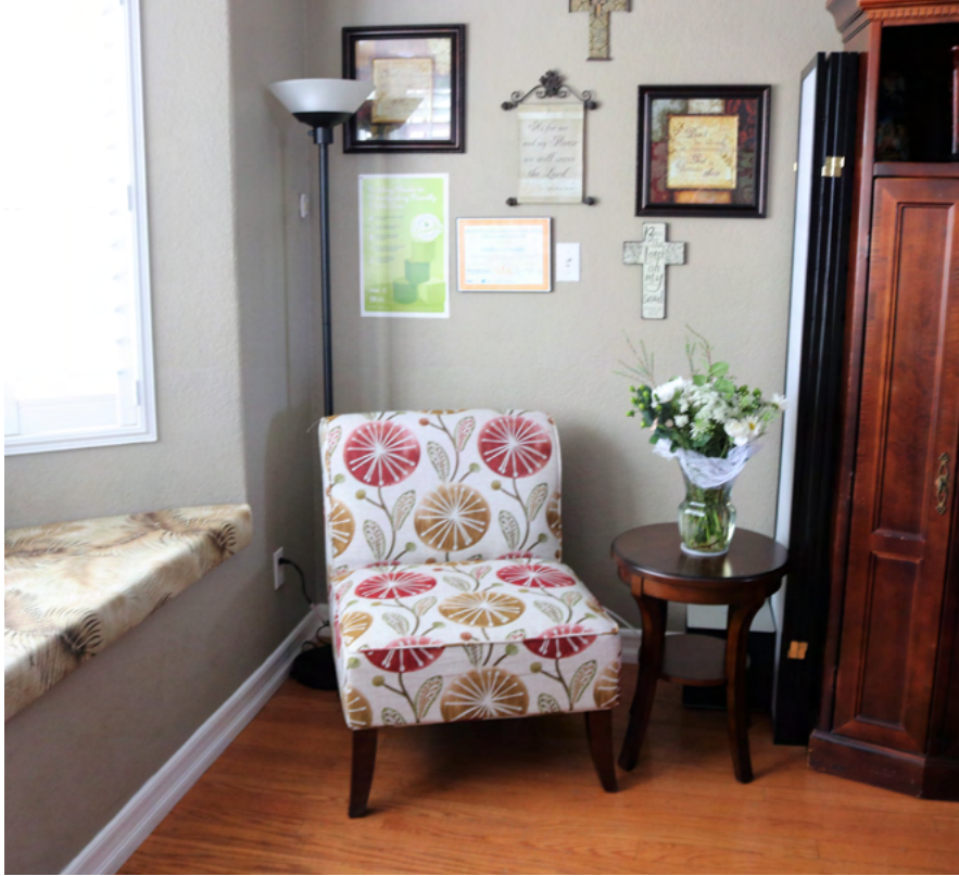
Figure 1: Breastfeeding Space in a Family Childcare Home

Figure 1 highlights a breastfeeding space set up in the living room of a family childcare home. The space includes comfortable seating as well as soft lighting. If families prefer more privacy, there is a folding screen, pictured on the right, that can be set up and taken down easily. As shown, when not in use, the screen can be folded up and placed next to the chair. The small side table presents a space for a glass of water or to display breastfeeding resources.