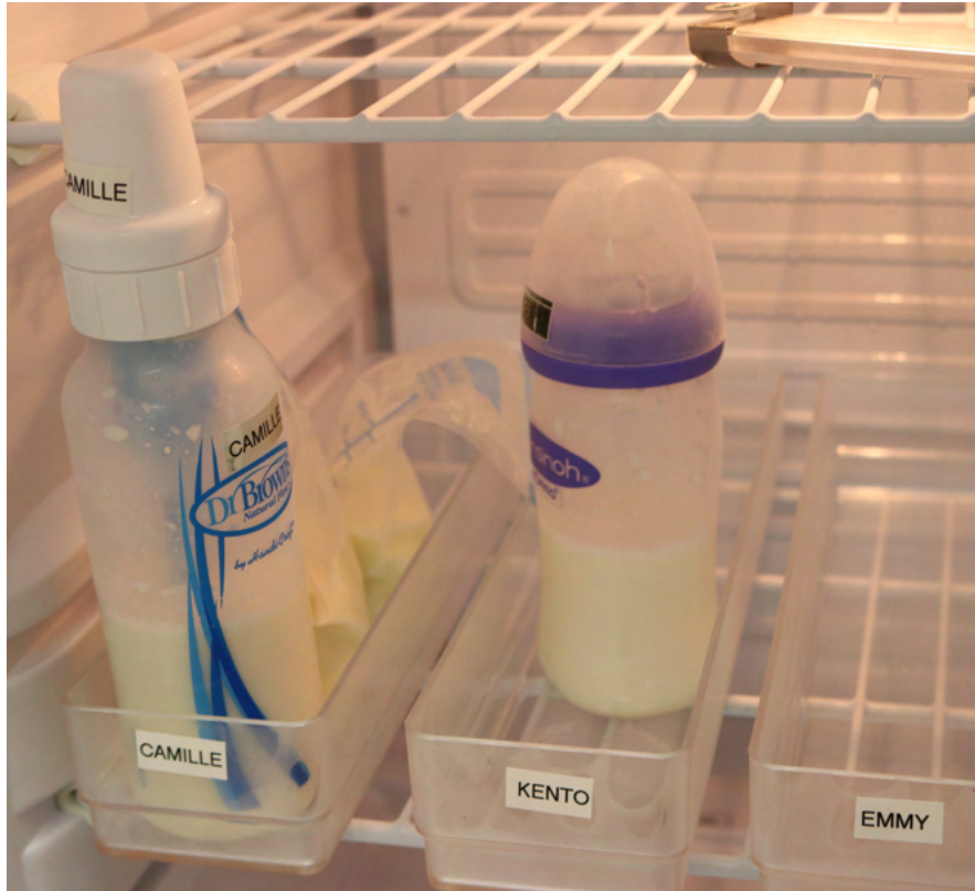
Figure 3: Breast Milk Storage in a Family Childcare Home

Figure 3 highlights breast milk storage in a family childcare home. A section of the standard refrigerator is designated to store breast milk. It is permitted to store breast milk in a home refrigerator alongside other food and drinks. Breast milk is being stored in bottles and bags and organized in trays clearly labeled with the child's name. The bottles and bags are also labeled with each child's name and date milk was expressed. The container on the far left has several bags of milk behind it, emphasizing that the milk in the bottle should be utilized first.