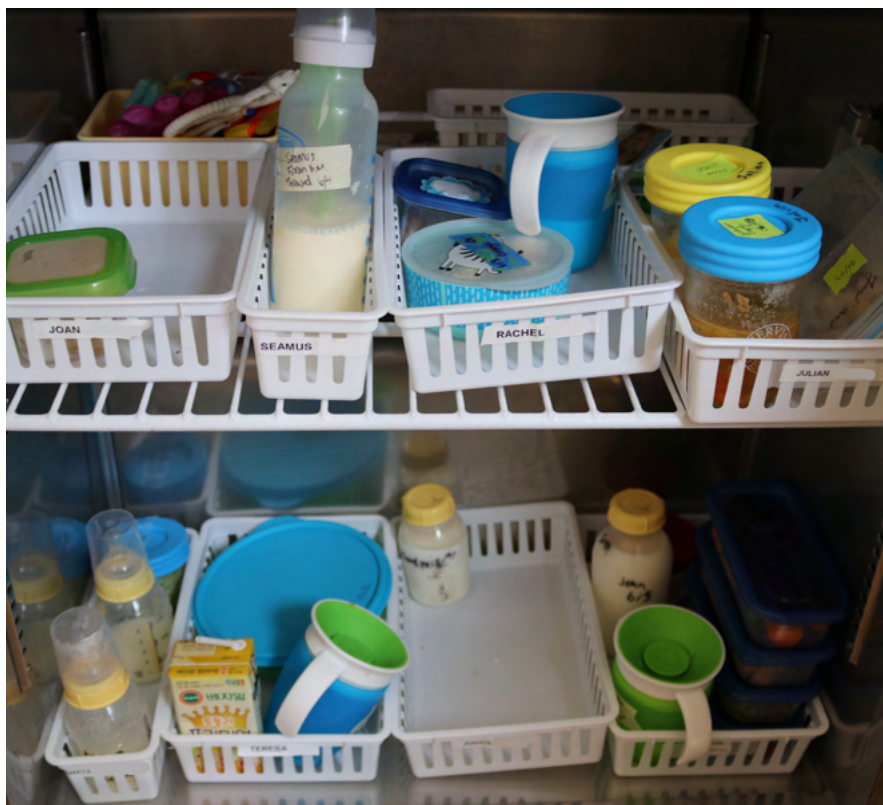
Figure 4: Breast Milk Storage in a Childcare Center

Figure 3 highlights breast milk storage in a family childcare home. A section of the standard refrigerator is designated to store breast milk. It is permitted to store breast milk in a home refrigerator alongside other food and drinks. Breast milk is being stored in bottles and bags and organized in trays clearly labeled with the child's name. The bottles and bags are also labeled with each child's name and date milk was expressed. The container on the far left has several bags of milk behind it, emphasizing that the milk in the bottle should be utilized first.